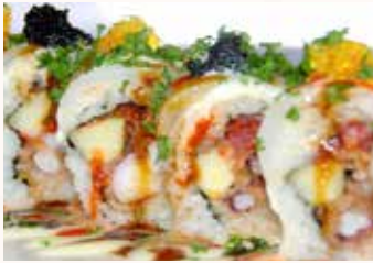
Bumble Bee Roll