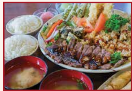
Teriyaki Dinner Special for 2

Served with Soup and Steamed Rice (Brown Rice optional. $1 extra)