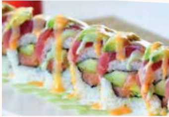
Silk Sensation Roll