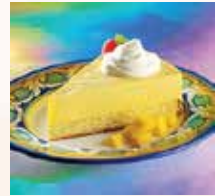
Mango Mousse Cake