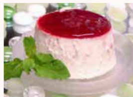
Raspberry Panna Cotta