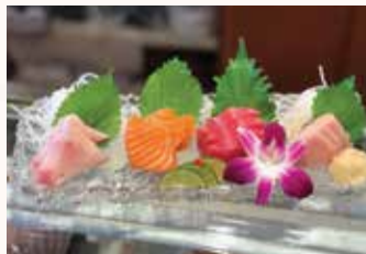
Sashimi Combo Deluxe