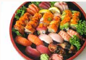
Sushi & Sashimi Tray