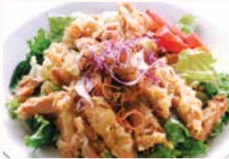
Chicken Kara-Age Salad