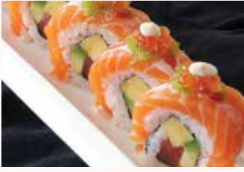
Emperor's New Roll