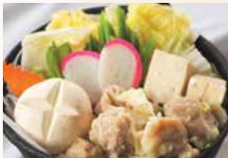
Wonton & Vegetable Soup