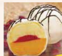
Mango Passion Fruit Bomba

Mango Panna Cotta $8 Sweetened Cooked Cream Topped with a Refreshing Mango Sauce