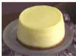
New York Cheesecake