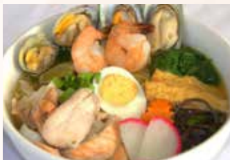
Tomatoes Seafood Ramen