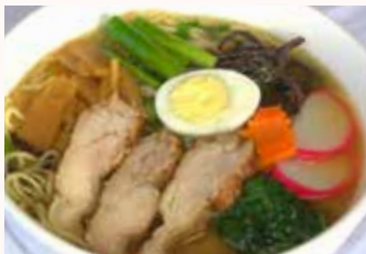
Chicken Miso Ramen