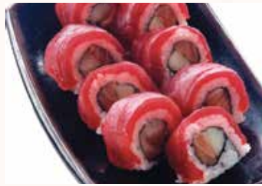
Cherry Blossom Roll