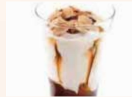
Coppa Strawberries & Caramel