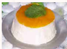
Mango Panna Cotta